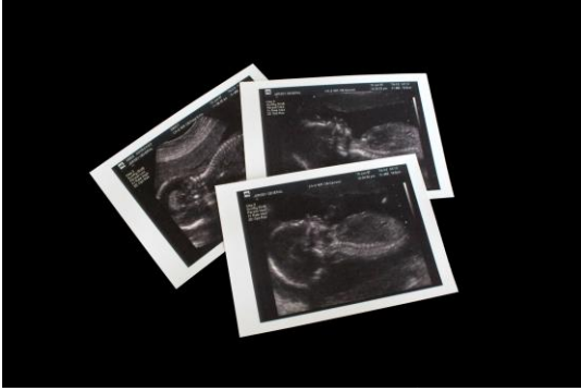
from the project 'Memory Box'