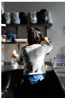
from the project 'Domestic'