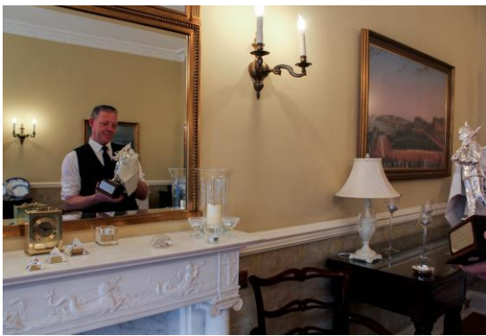
from the project 'The Butler'