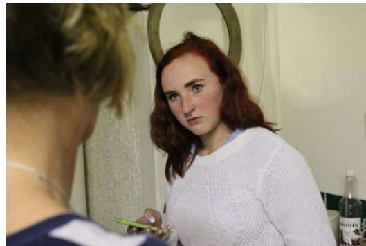
from the project 'Back in my day...'