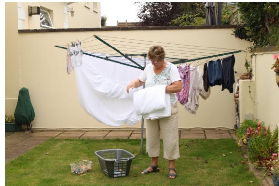
from the project 'The Heavens'