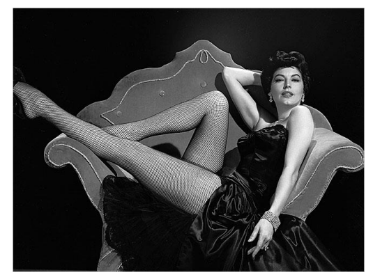
Film Noir, Femme Fatale