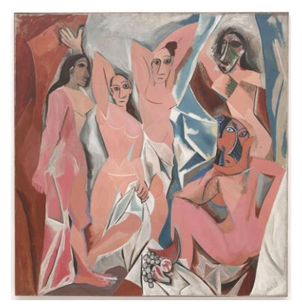
Picasso, Les Demoiselles d'Avignon

Similarly, the photographic work of Cindy Sherman's Untitled Film Stills informs her spectators of female stereotypes and their negative connotations. Sherman's work really stands out in the photography world and has really furthered public knowledge and attention on the unrealistic and unfair expectations faced with female stereotypes. Sherman's work mimics stereotypes in film and she creates personas of women in such films as well as those she has come across in real life and exaggerates them to make her staged images come across as more sarcastic and almost a parody of those women. Sherman's work embodies the problems within our society of how we treat women and how we expect them to be. Women are expected to be glamorous all the time, as well as juggle a full-time job with house chores. We live in an unfair patriarchal world that most people ignore purely because they can. Sherman's work almost objectifies herself, she portrays herself as elegant women and creates personas that are soft and would attract men. She does not tend to hold back in her photographic work and in other works she poses in over the top nude photographs creating new personas and making her own props of different parts of the female anatomy. She exaggerates