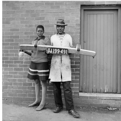
2. David Goldblatt. She said to him, 'You be the driver and I'll be the madam', then they picked up the fender and posed. Hillbrow, Johannesburg. 1975.