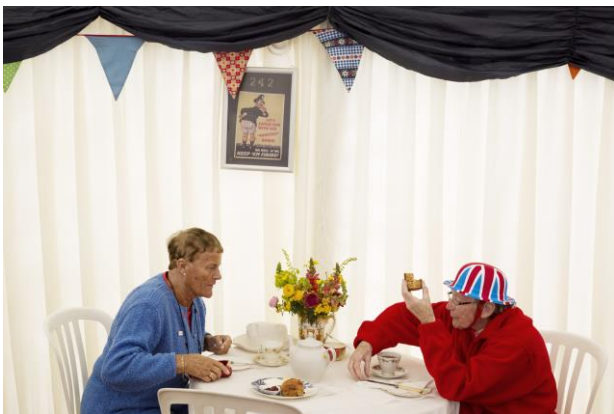
3. Martin Parr. Liberation Day, Jersey. 9th May 2013.