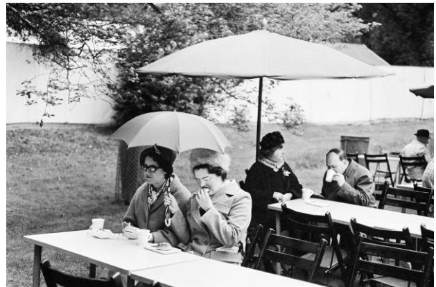
4. Tony Ray-Jones. May Day Celebrations. c. 1967.