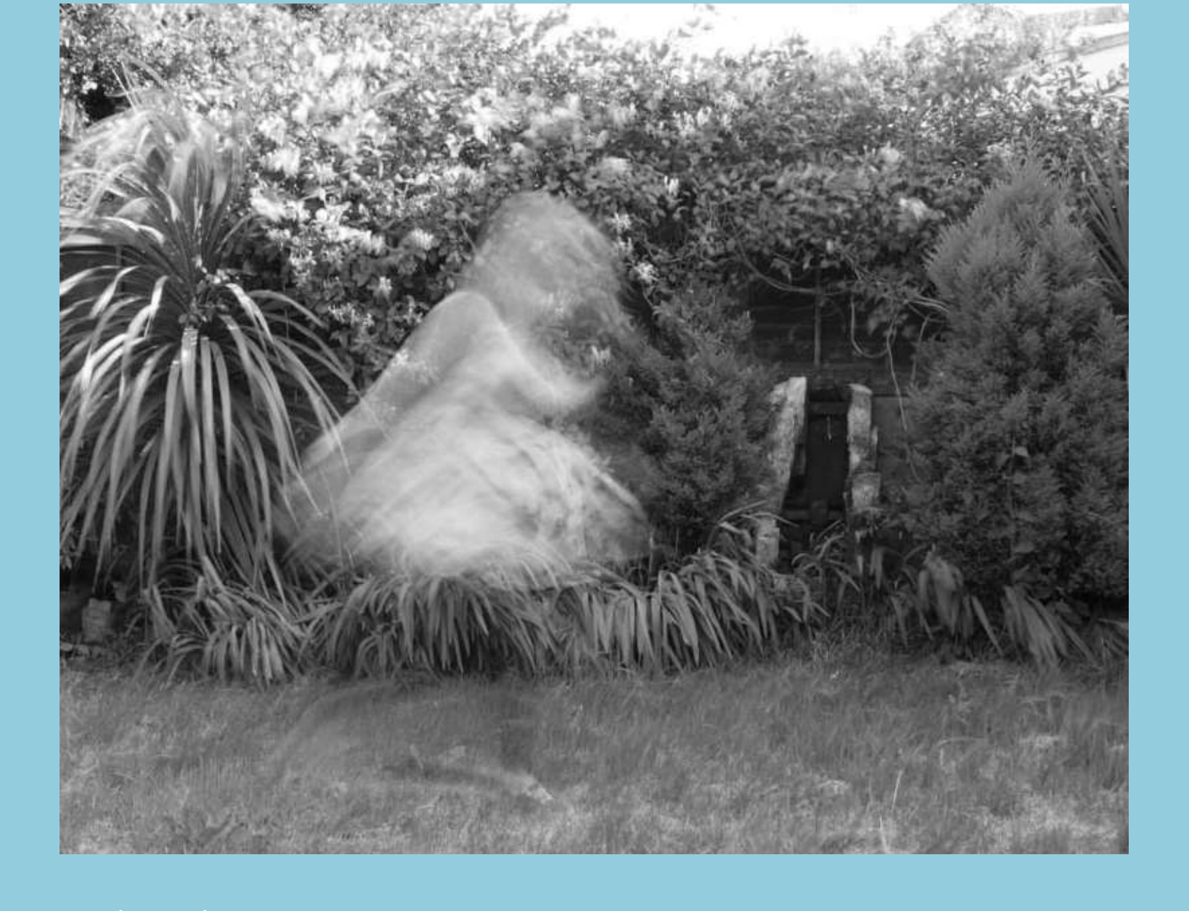
Favourite Final - Sophie