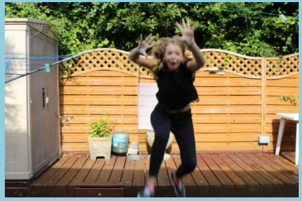
Sophie Ellis- Fox